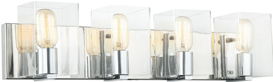
Image May Not Reflect Fixture Finish